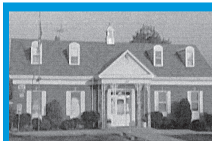
Milton Township Hall 1492 N. Main Wheaton